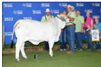
Full sibling to this mating.

+Mr. V8 458/7 +MR. V8 160/8 +Miss V8 835/7 +Mr. V8 380/6 +MISS V8 902/7 JDH Dawn Manso