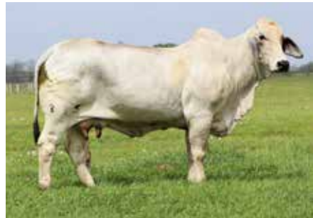
"OLD" LUPITA Mother of 160, BRC Geronimos Cadillac 230, and BRC Yesterday Road 227 herd bulls.