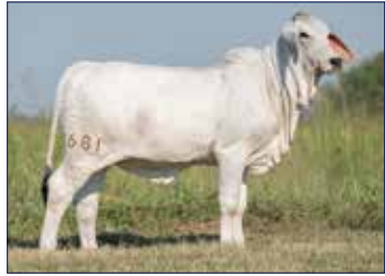
Full sibling to this mating