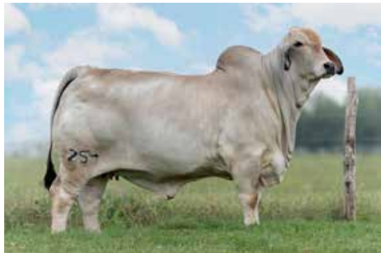
BRC ME AGAIN MARGARET 254 Dam of Lot 4 National, International, and World Brahman Congress Champion Female