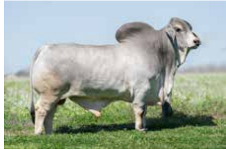
BRC GERONIMOS CADILLAC 230 Half Brother to Lot 5

You're gonna want to sit down and really think about this mating.