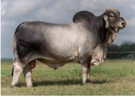
BRC AMOS MOSES 257 Sire of Lot 4 National Champion Bull Reserve International Champion Bull