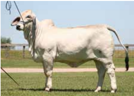
"YOUNG" LUPITA Photo of Lupita when she was about 18 months old. About 6 months older than 724 is at this point.