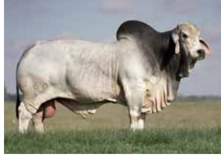
+BRC 160/8 Paternal Grandsire of Lot 5 Also a Half Brother to Lot 5