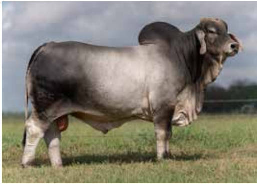
BRC AMOS MOSES 257 Sire of Lot 4 National Champion Bull Reserve International Champion Bull